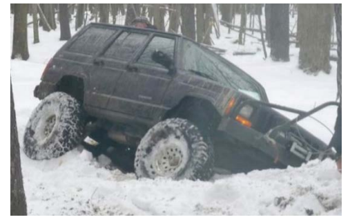
17th – 19th Cal4Wheel convention Visalia, CA ( E )